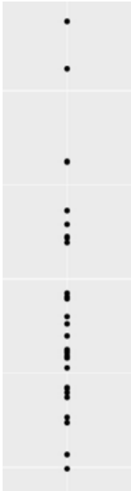
The actual values in a distribution